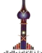
وزارة الثقافة والإعلام Ministry of Culture and Information